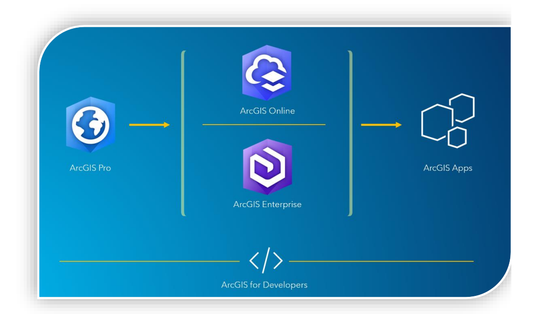
The modern ArcGIS platform

In 2018, ArcGIS is made up of several products that can be used independently, but are designed to be used together, where they provide their full value. The three primary offerings are ArcGIS Desktop (which includes ArcMap and ArcGIS Pro). ArcGIS Online, which is a software-as-a-service cloud-based mapping offering, and ArcGIS Enterprise, which provides a complete mapping and analysis platform running on your own infrastructure on-premises or in the cloud. Supporting these core products is a plethora of applications that run on devices of all typesdesktops, smartphones and tablets. The ArcGIS platform also has a rich developer ecosystem, via APIs and SDKs to extend and further develop core products.